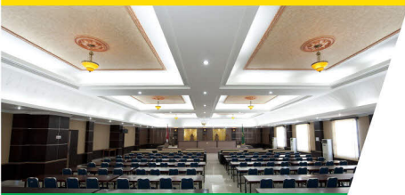
■ Mahkamah Syar'iyah, Aceh