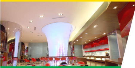
■ Ibis Hotel, Bandung