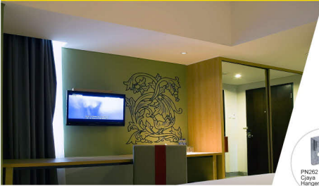
■ Grisea Gading Serpong, Banten